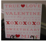
Word Collage Boards