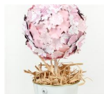
Mother's Day Centerpiece