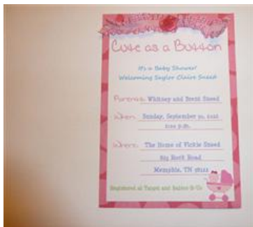
Add Ribbon & Button

Cut 4 inch lengths of ribbon and glue with a dot of hot melt glue in the center upper edge of card. Attach a button in the center. I used hot melt glue to attach my ribbon and buttons, but if you can sew, go for a hand stitched look. That's it! You're done.