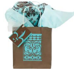
Gate Gift Bag