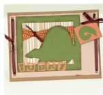
"6 Today" Card