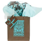
Gate Gift Bag