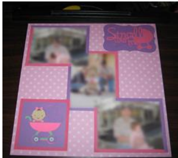
Stroll With Me

Add everything to page and paste where you want .