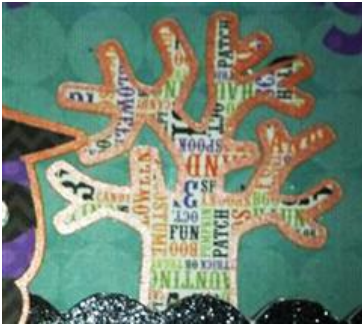
Create a Critter 2 Tree cut at 4"

This tree was originally going to be black, but as I removed it from the cutting mat I noticed how cute the paper on the back side with the words was.