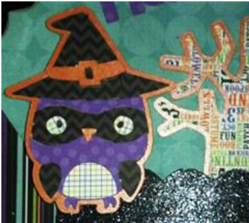
Owl from Create a Critter 2, cut at 4"

Here is my cute little Owl assembled. I used pattern paper for all of this from the 6x6 Doodlebug paper pack. Don't be afraid to use patterned paper to make an image.