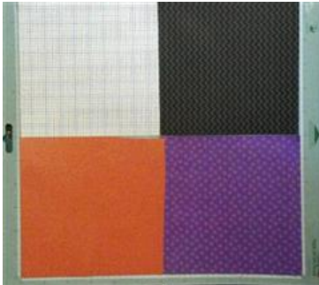
Papeer set up on cutting mat, the insert arrow on the left

I applied the paper in 6x6 sections to the cutting mat. I used one layer on the cutting mat in Cricut Craft Room. Make sure you use at least 6" of paper on the cutting mat, the more surface area the paper is in contact with the cutting mat the better it sticks to the mat and less chance to slip when it is being cut.