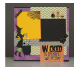
Wicked Witch Layout hanging