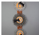
Boo Rosette Wall hanging