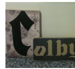
Pirate Name plaque