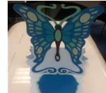
Butterfly Display card