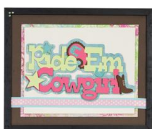
Ride 'Em Cowgirl Frame