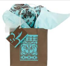
Gate Gift Bag