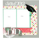
Class of 2012: You did it! Layout