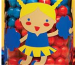
Gum Ball Jar