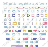
Cricut® Fabulous Finds Cartridge