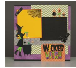
Wicked Witch Layout