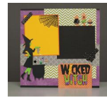
Wicked Witch Layout