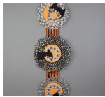
Boo Rosette Wall hanging