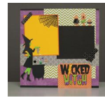
Wicked Witch Layout