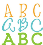
Lyrical Letters Cartridge