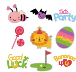
Create a Critter 2 Cartridge