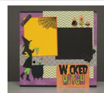
Wicked Witch Layout