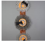
Boo Rosette Wall hanging