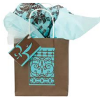
Gate Gift Bag