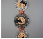
Boo Rosette Wall hanging