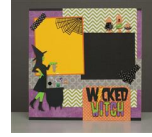
Wicked Witch Layout