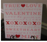
Word Collage Boards