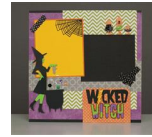
Wicked Witch Layout