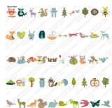
Give a Hoot Cartridge