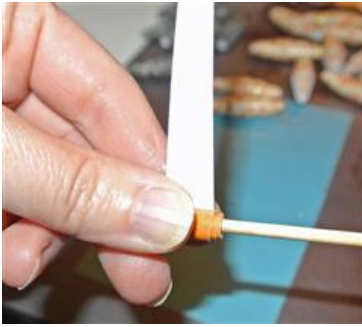
Wrapping paper to make bead.

I used CCR and a basic triangle shape from George to stretch the triangle to the appropriate size. I used a width of 1.5" and .75". The thickness of your bead will be determined by the length you use. Simply wrap the paper tightly. I used a kitchen skewer.