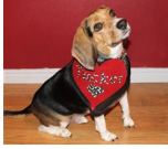
Valentine Doggie Bandana