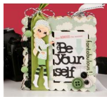
Be Yourself Mini Album