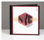
NYC 2009 Mini Album