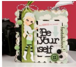
Be Yourself Mini Album