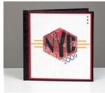
NYC 2009 Mini Album