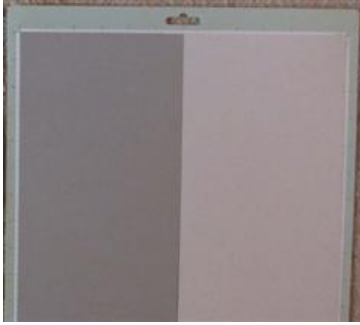
Mat Layout 2