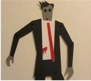
Zombie - Movable Monsters Contest

Layout cardstock on two mats as shown. Cut out all pieces using the cut file at 6".