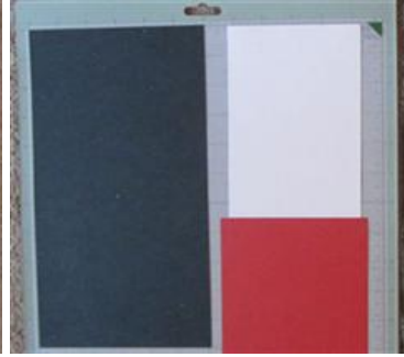
Mat Layout 1