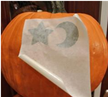
Adding the images to the pumpkin.

Place the images on to the surface and rub until they are secured. The Jack-o-lanterns images were cut at 6" and the Mouse at 3".