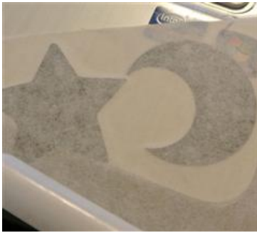
Adding Images to the Transfer Tape.

Pick your favorite Jack-a-lantern face, size to fit your pumpkin and cut at vinyl settings. I used Medium Pressure and a blade depth of 4. It cut through the backing; however, for this project it was not that important. I simply rubbed the transfer tape over the images until they came off the backing.