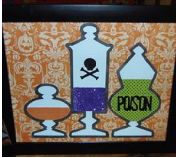
Poison Jars Frame

For Poison Jars Frame: Using A Frightful Affair, cut at 7" and cut at 1" using the "phrase" feature. Add glitter to the liquid on the middle jar, add glitter to the skull and crossbones, and add glossy accents to the word "poison." Adhere the jars to some patterned cardstock and place in a frame.