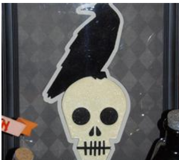
Raven & Skull Frame

For Raven & Skull Frame: Using A Frightful Affair, cut at 10" from your choice of cardstock. Cover the raven with adhesive and black flocking powder, cover the black portion of the skull with black glitter, and cover the rest of the skull with crackle accents. Adhere the raven and skull to some patterned cardstock and place in a frame.