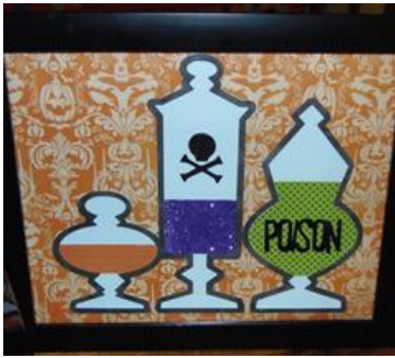
Poison Jars Frame

For Poison Jars Frame: Using A Frightful Affair, cut at 7" and cut at 1" using the "phrase" feature. Add glitter to the liquid on the middle jar, add glitter to the skull and crossbones, and add glossy accents to the word "poison." Adhere the jars to some patterned cardstock and place in a frame.