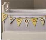
Welcome Crib Banner