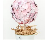
Mother's Day Centerpiece