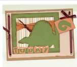
"6 Today' Card