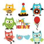
Hoot 'n' Holler