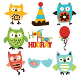
Hoot 'n' Holler