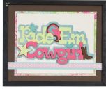
Ride 'Em Cowgirl Frame