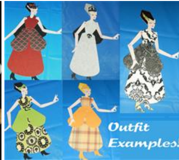
Outfit Examples! The possibilities are endless!