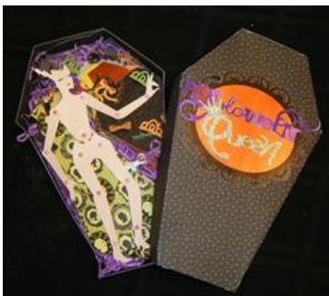
Doll in gift box

Use Happy Hauntings cartridge to make 3-D coffin—(2 cuts of same needed to make box bottom and lid)