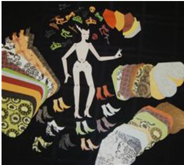
Doll and accessories

Use Bride of Frankenstein clothes parts to weld together a dress, cape, apron, shoes and hair (my cut files are included) Cut in mix and match Halloween patterns. Cut bows, skulls, lightning accessories from Rock princess Cartridge—glue these to back of small brads. Poke holes in pieces with the Cricut hook tool. Brads hold pieces in place—straps of dress fold over her shoulders to hold in place