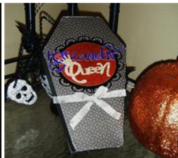
Closed gift box