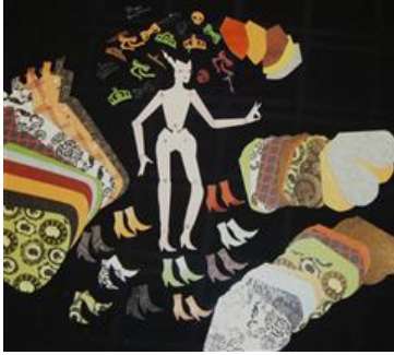
Doll and accessories

Using Movable Monsters Bride of Frankenstein cut body parts. Attach together with scrap booking brads.