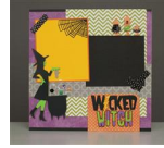
Wicked Witch Layout