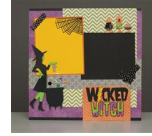
Wicked Witch Layout