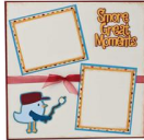
S'more Great Moments Layout