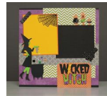
Wicked Witch Layout