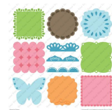
Cricut® Elegant Edges Cartridge