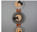
Boo Rosette Wall hanging