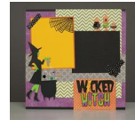
Wicked Witch Layout