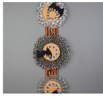
Boo Rosette Wall hanging