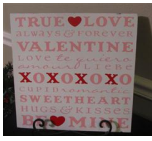
Word Collage Boards