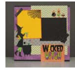
Wicked Witch Layout