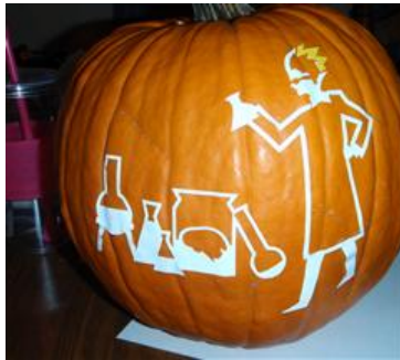
cuts on pumpkin