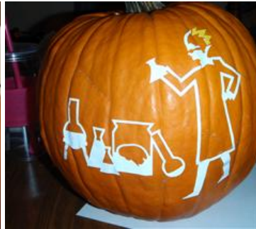
cuts on pumpkin