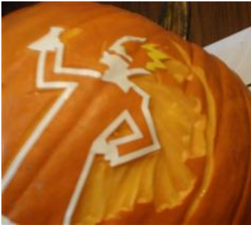
carving off stencil

Layout as desired on pumpkin and carve around cuts