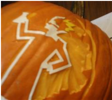
carving off stencil

Layout as desired on pumpkin and carve around cuts