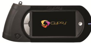
Gypsy™ handheld design studio for