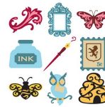
Cricut® Sentimentals Cartridge