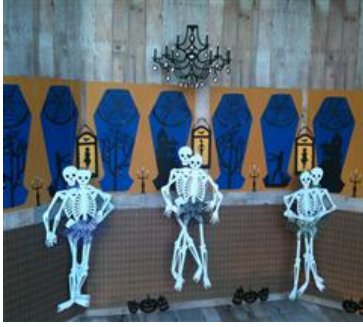
The Skeleton Ball