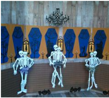
The Skeleton Ball