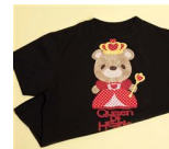
Queen of Hearts T-shirt