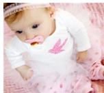
Bird Baby Sleeper