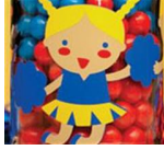
Gum Ball Jar