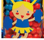
Gum Ball Jar