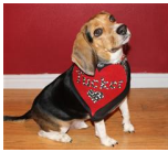
Valentine Doggie Bandana