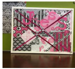
Easy DIY Bulletin Board.