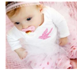
Bird Baby Sleeper