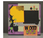
Wicked Witch Layout