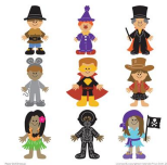
Paper Doll Dress Up Cartridge