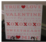
Word Collage Boards