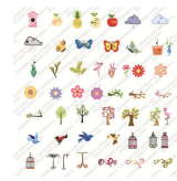
Cricut® Serenade Solutions™ Cartridge