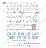
Cricut® Opposites Attract Cartridge