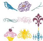
Home Décor Cartridge