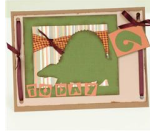
"6 Today" Card